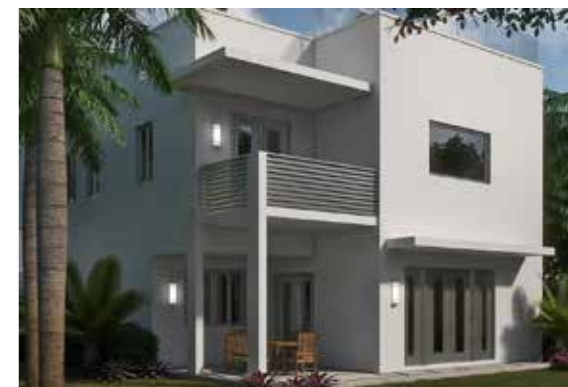
ELEVATIONS WITH OPTIONAL TERRACE