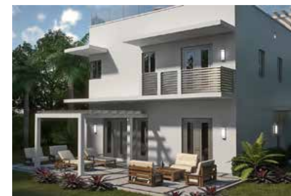
ELEVATIONS WITH OPTIONAL TERRACE