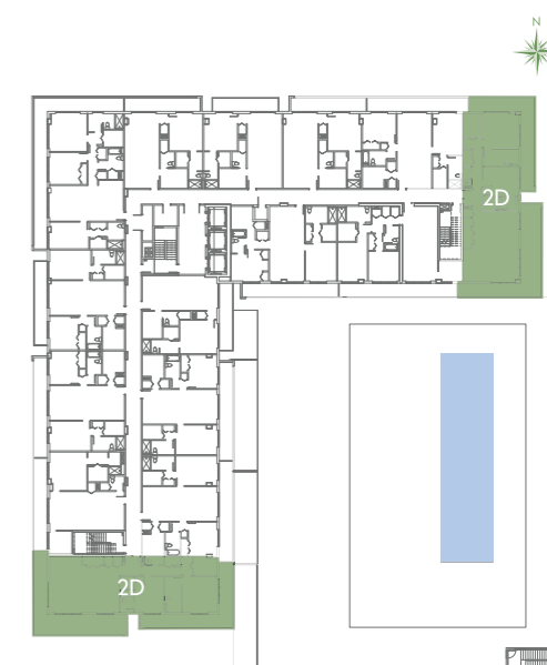
Key Plan of floor 12.