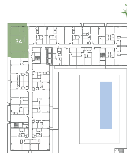
Key Plan of floors 6 & 7.