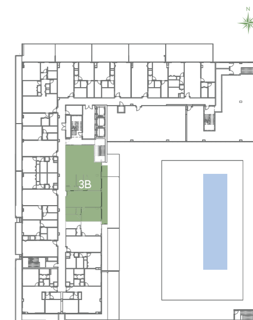
Key Plan of floor 5.